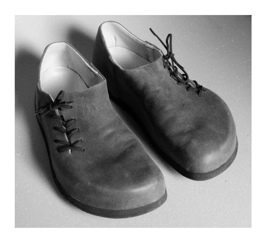
Circa 1980's and 2014